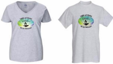
Ladies Fruit of the Loom / Men's basic T-Shirt classic

For anyone that did not get a T-shirt from the order back in May, we're going to do a new one on September 30th.