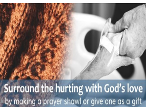
Surround the hurting with God's love by making a prayer shawl or give one as a gift.

All are welcome to bring your knitting or crocheting and attend the Bethlehem Lutheran/Light of Christ Prayer Shawl Ministry gathering from 10:00-11:30 am Tuesday, September