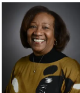
Minister Glenda Robinson March 17